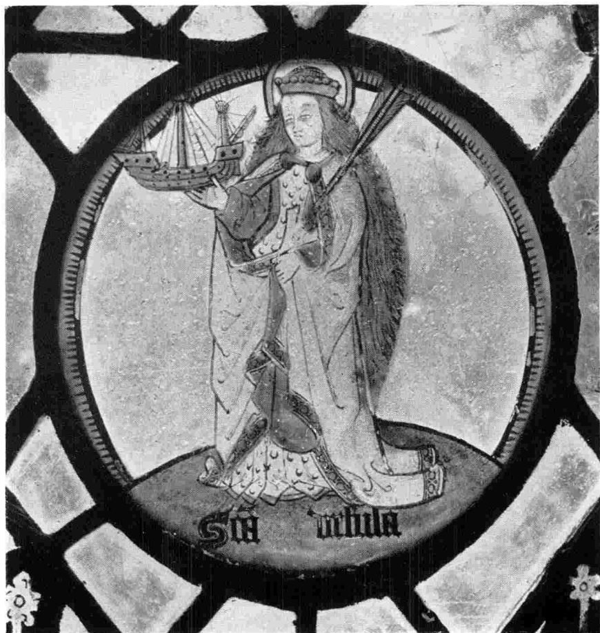
SOUTH ELMHAM AL. SAINTS St. Ursula.